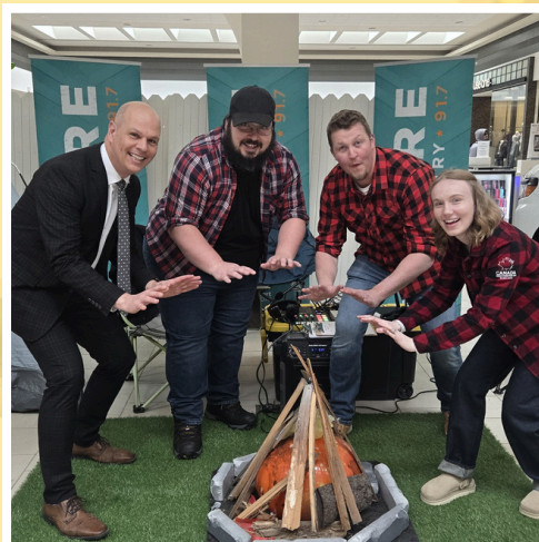
Pure Country Radio hosted Camping for Cans at the New Sudbury Centre, collecting 572 lbs of food and monetary donations in support of the Sudbury Food Bank.