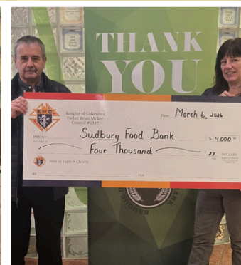
$4000 donation from Knights of Columbus #1387