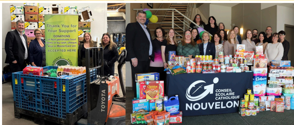
CSC Nouvelon staff collected and donated 462 lbs of food to the Sudbury Food Bank as part of their "Banque alimentaire NOUVELON" initiative.