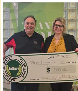
$1500 donation from Weber Supply Distributors