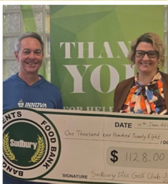
$1128 donation from Sudbury Disc Golf Club Ice Bowl 2026