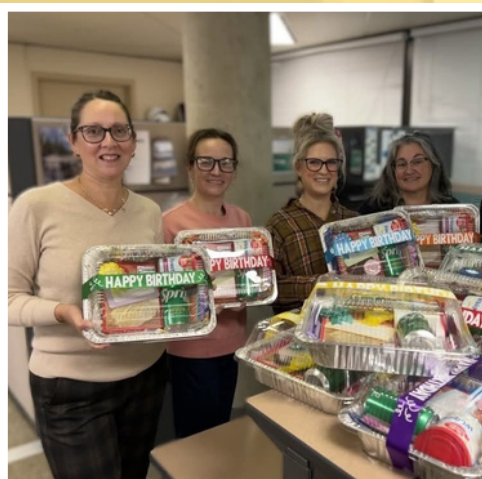
City of Greater Sudbury Real Estate team delivering birthday cake kits to the Sudbury Food Bank as part of their tradition of giving back on their birthdays instead of receiving gifts.